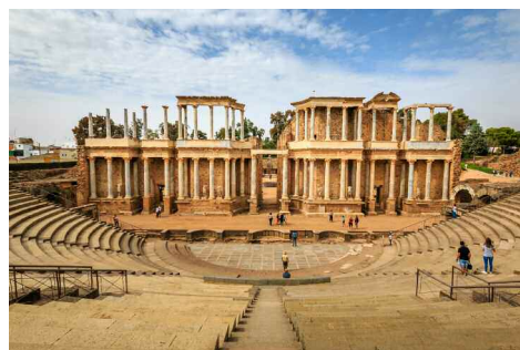
Roman theater in Mérida