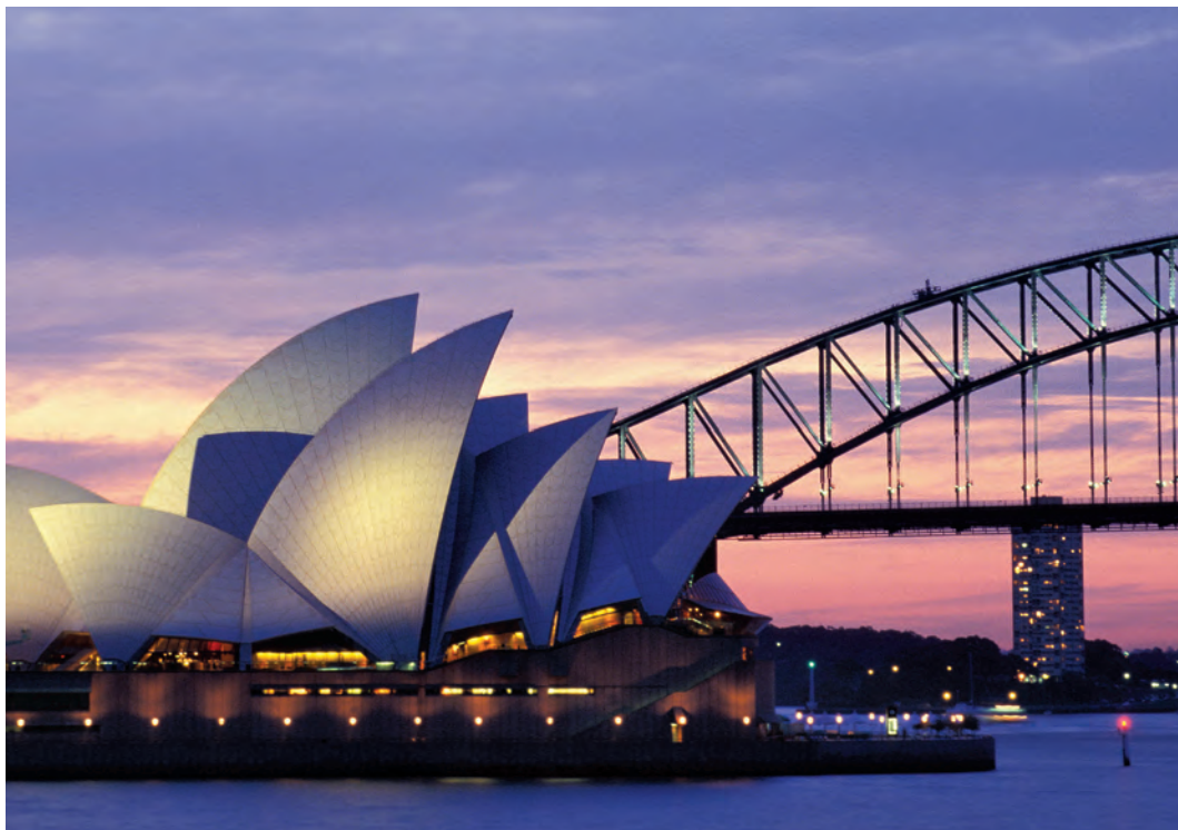
The Sydney Opera House and Harbour Bridge at dusk

Day 9: Ayers Rock/Sydney This morning we visit the base of Uluru and the interesting museum here. Mid-day we fly to Sydney, arriving late afternoon. B,D