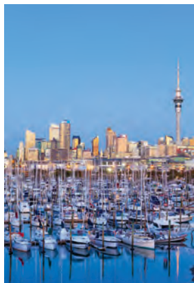
Auckland, City of Sails

Day 18: Queenstown/Rotorua We depart today for the Maori center of Rotorua, with its geysers, bubbling mud pools, and hot thermal springs. Upon arrival, we take a panoramic tour of this city on the shores of Lake Rotorua. This evening we visit Tè Puia Thermal Reserve and Cultural Centre for a traditional hangi dinner and Maori performance. B,D