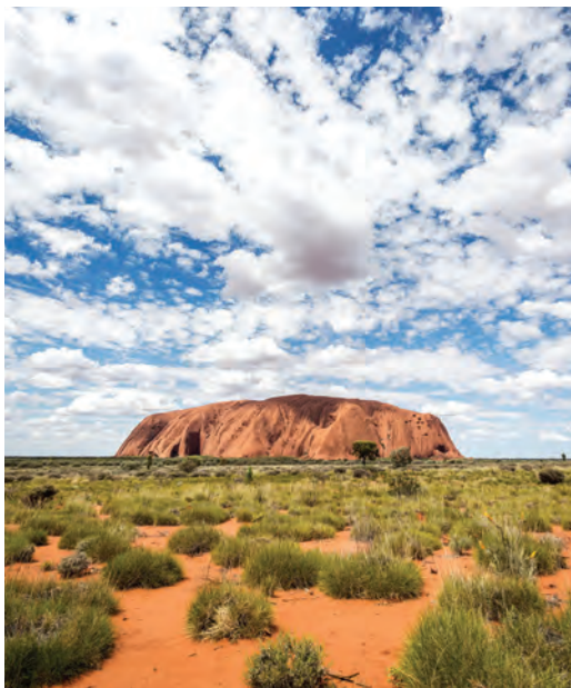
We visit the Aboriginal site of Uluru (Ayers Rock) on Day 8.